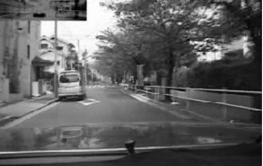
Figure 6 Risky phase No.12